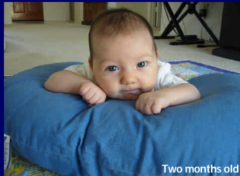
Two months old