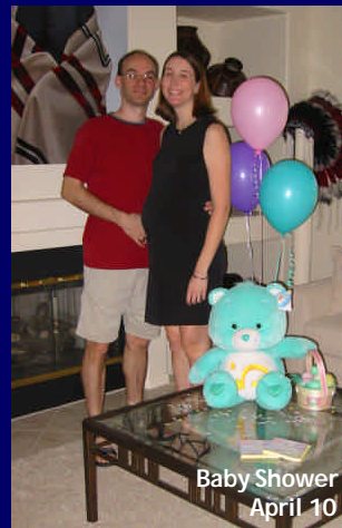
Baby Shower April 10