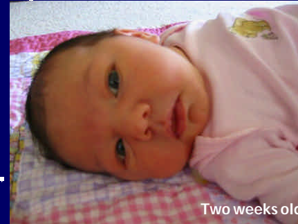
Two weeks old