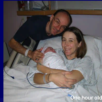
One hour old