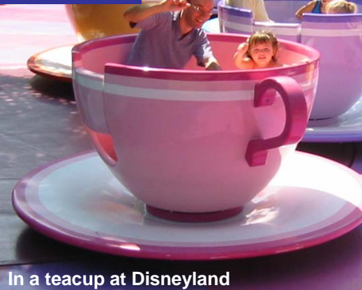
In a teacup at Disneyland