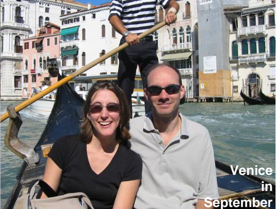
Venice in September