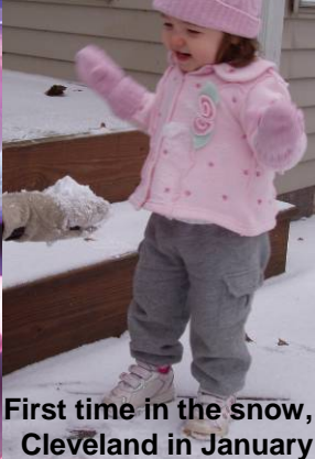
First time in the snow, Cleveland in January