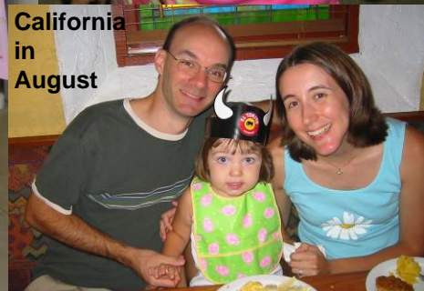
California in August