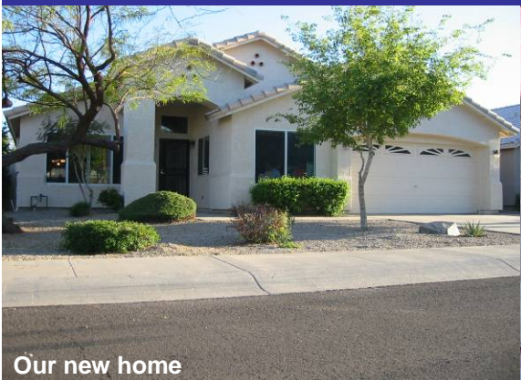
Our new home