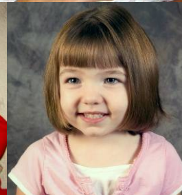
First school picture